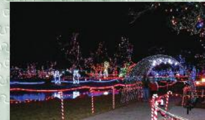
Rotary Winter Wonderland display at Wildwood Park.