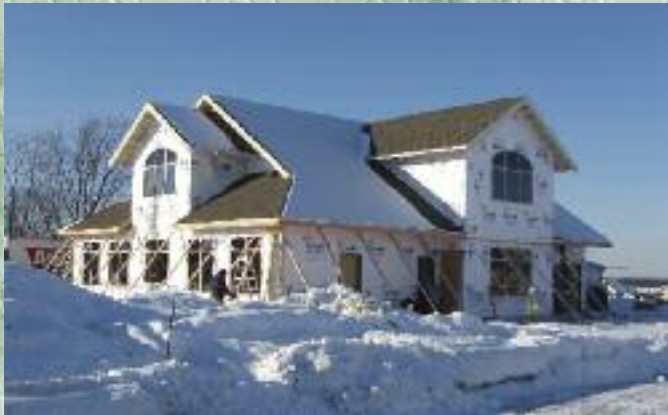
Prairie Crossing commercial building on west McMillan.