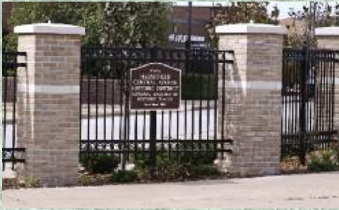
New "Gateway to Downtown".