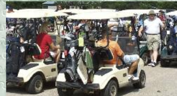
Golf carts loaded and attendees ready to tee off at Chamber Caper.