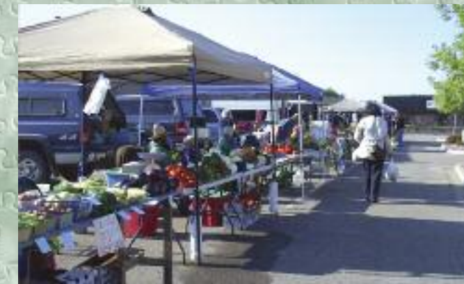
Main Street Marshfield's Farmers Market.