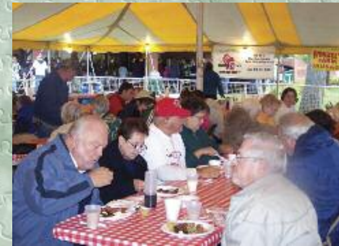
Folks enjoyed a potato pancake breakfast at Maple Fall Fest.