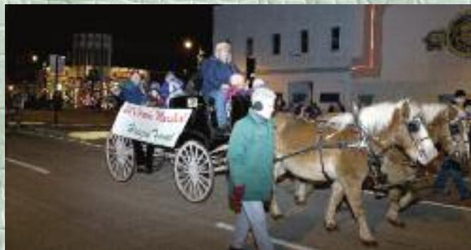
Main Street Marshfield's Holiday Parade.