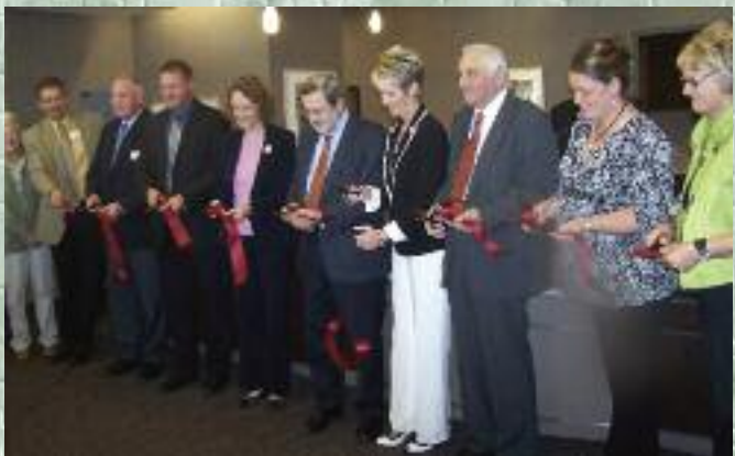
Ribbon cutting held at Marshfield Clinic's Family Health Dental Center.