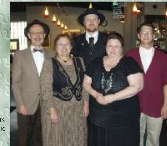
Marshfield historic re-enactments during Historic Preservation Month.