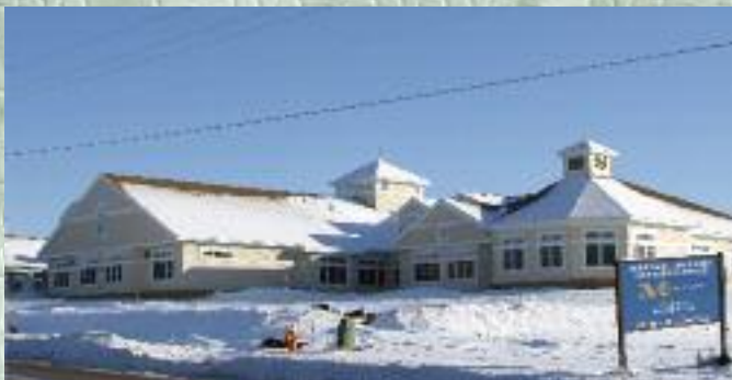
Stoney River Assisted Living on west McMillan.