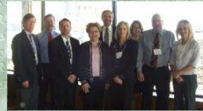
Central Wisconsin Days group from Marshfield.