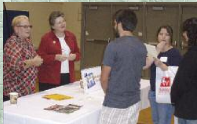
Students visit the Hospitality and Tourism Career Cluster at Xtreme Xploration.