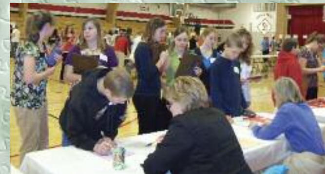
Spencer 8th-grade students making "purchases" during their Reality Store.