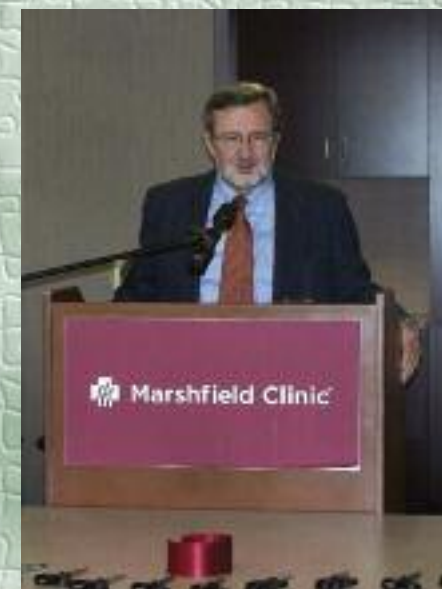
Rep. Dave Obey spoke at Marshfield Clinic's Dental Center grand opening ceremony.