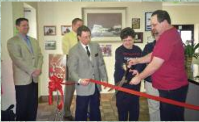
Chips ribbon cutting at their new location on Marshfield's south side.