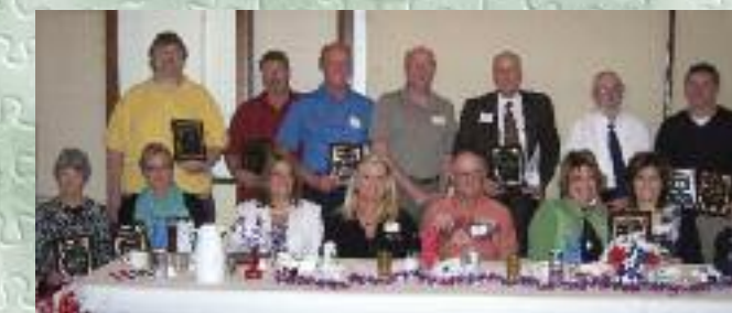
Recipients of the "Best of Marshfield" awards.