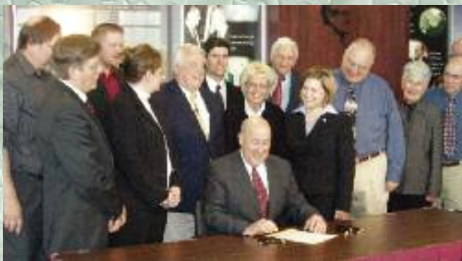
Governor Doyle at signing ceremony at Laird Center for Research.