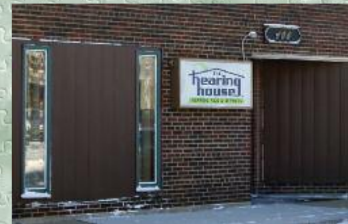
The Hearing House, 106 W. 5th St.

Milan Fashions Stampin 'n Scrapin Fun Tiki Jewelry No Limit Manufacturing DC Door & Glass LLC Perfect Fit Alterations