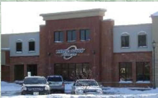
Total Body Fitness, 104 Northridge St.