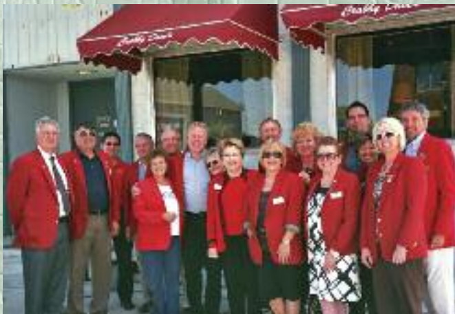
Red coats well represented at Crabby Dave's ribbon cutting.

✚ With nearly 50 members, the Marshfield Young Professionals Network continues to provide an avenue to retain our young professionals in the greater Marshfield area. The group has coordinated an annual brat fry, Sand for Sandboxes fundraiser, Wine & Cheese Tasting event, Mother's Day hydrangea sale, volleyball leagues, annual fall event, monthly socials and volunteered at Rotary Winter Wonderland.