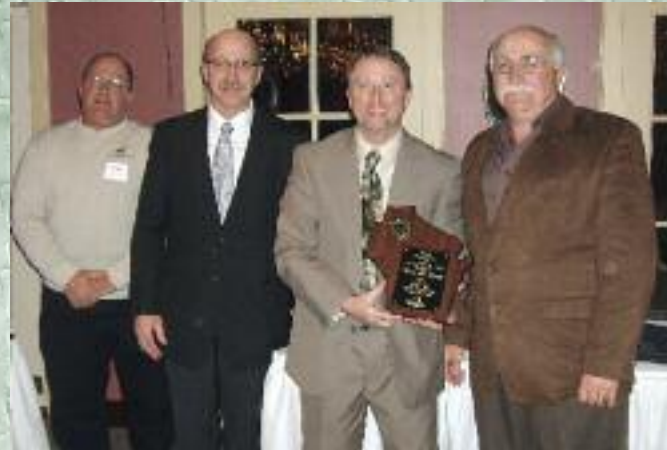
MACCI's Friend of Agriculture, Nasonville Dairy.