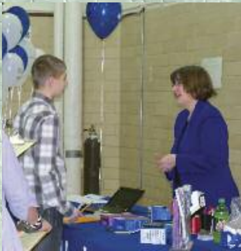
2010 Reality Store at Marshfield Middle School.