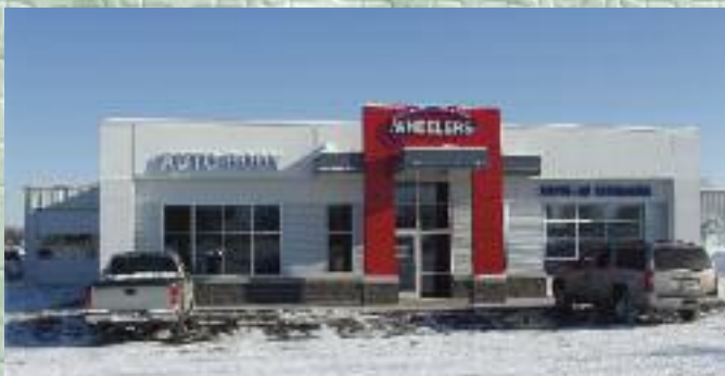
Wheelers Chevrolet GMC's new collision repair center.