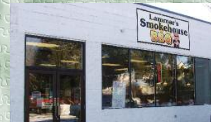
Lammar's Smokehouse BBQ, LLC, 1504 S. Central Ave.