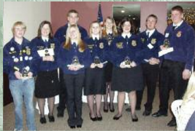
MACCI's Agri-Business Committee's Outstanding Ag Seniors.