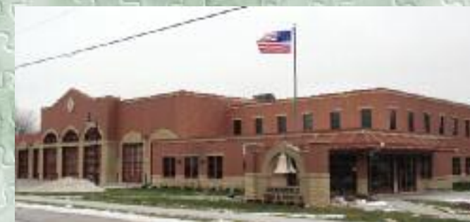
Marshfield's new fire station. LEED certified.