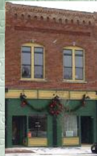
Various facade renovations downtown.