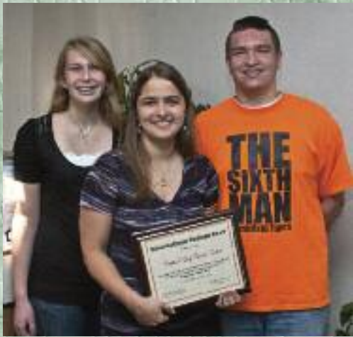
Youth Apprenticeship students employed at Central City Credit Union in Marshfield High School.