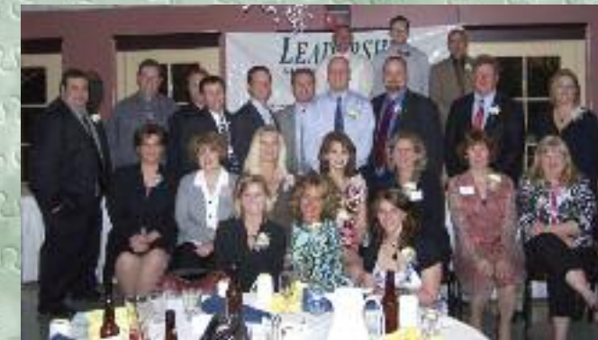
Leadership Marshfield class of 2010.