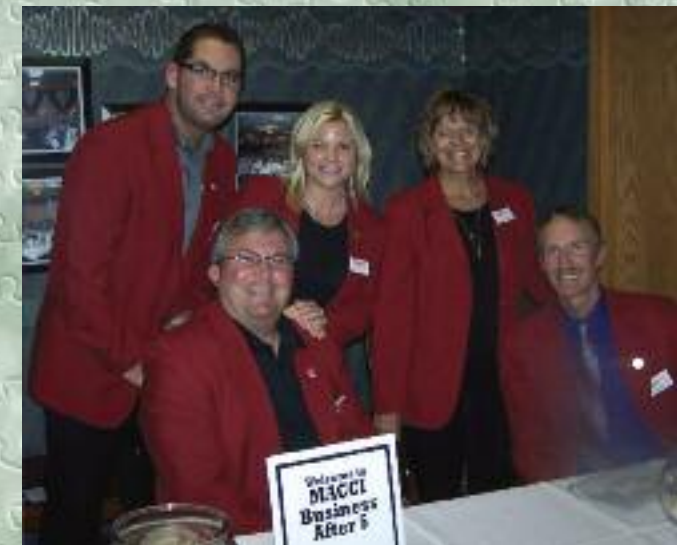
Ambassadors working registration table at Business After 5.