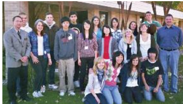
AES reception for area schools.