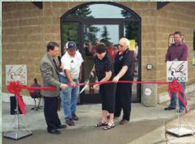
Weber's Farm Store ribbon cutting.