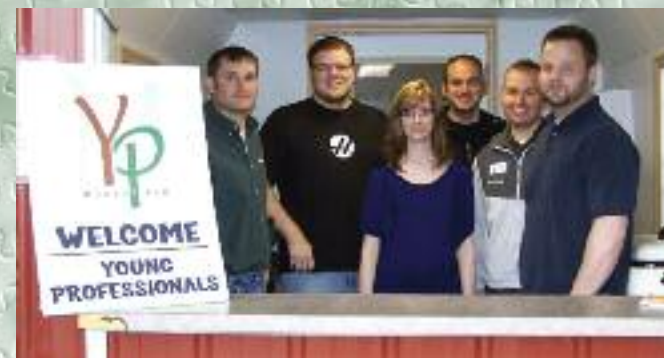
Young Professionals working at the brat fry.