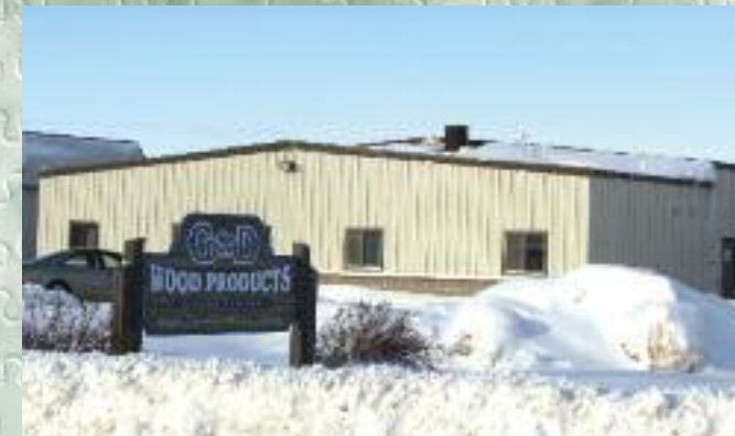
G&D Wood Products adds a 5,900 sq. ft. addition.