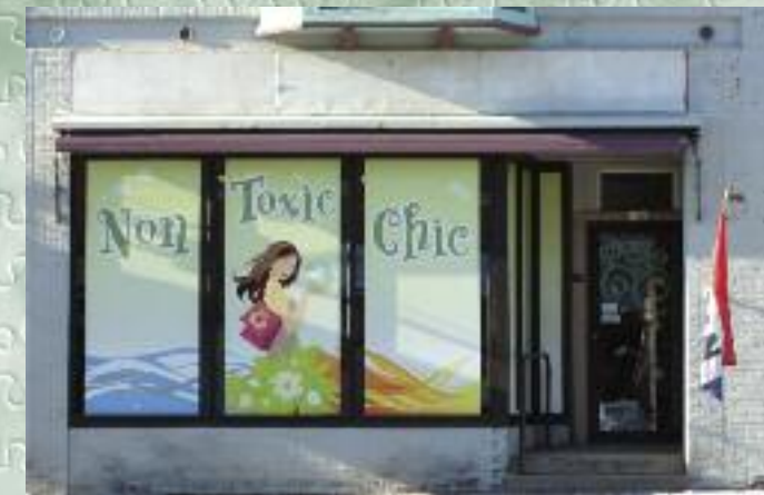
Non-Toxic Chic, 126 S. Central Ave.