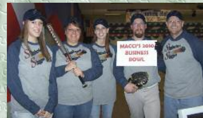
Slumberland Sluggers won best dressed team at Business Bowl that took on a sports theme.