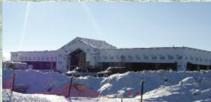
Prevention Genetics new addition in Air Business Park.