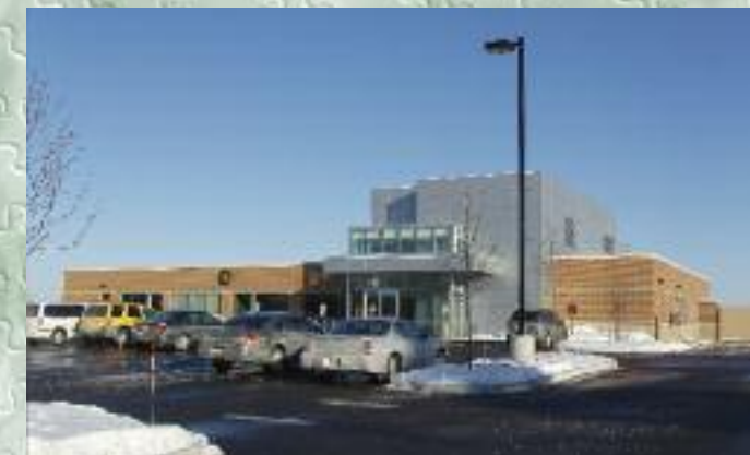
Marshfield Clinic's Family Health Center Dental Clinic.