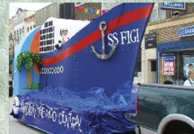
Best overall float in the Dairyfest parade went to Figi's.