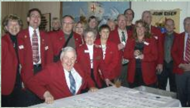
Ambassadors welcoming guests at Annual Meeting dinner.