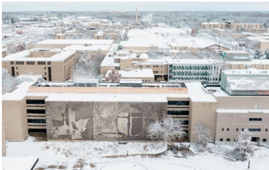
A snow covered UWSP Campus

For questions, please contact the COVID-19 Hotline at covid@uwsp.edu or 715-346-2619. For parking details or more information, see the COVID testing website.